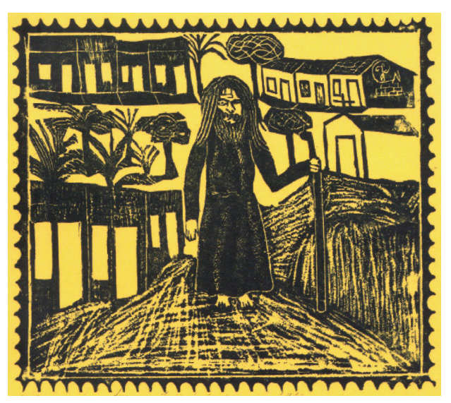
Woodcut portrait of Antonio Conselheiro

In earlier times, Quixeramobim was one of the few villages of the sertão with a primary school. In 1845, there were only 30 primary schools in all of Ceará, with total enrollment of 1,332 pupils. One of the pupils in Quixeramobim was Antonio Vicente Mendes Maciel (1830-97), later famous as